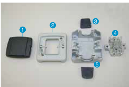
Materials of switches and socket outlets