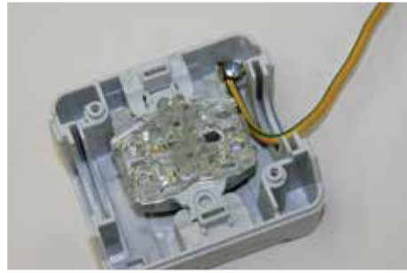
Possibility to connect earthing conductor to switches.