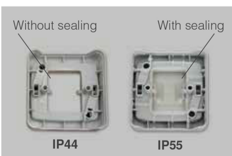
Differences between IP44 and IP55