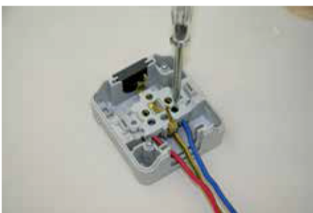
With screw terminals