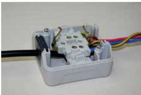
Possibility to pass the cord below the mechanism