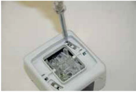
You do not need to screw or unscrew through thanks to design.