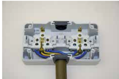
Bridge circuits are ready. Wide space for connection conductors.