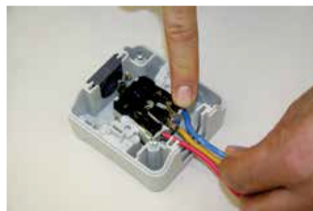
Without screw terminals and Socket Outlets